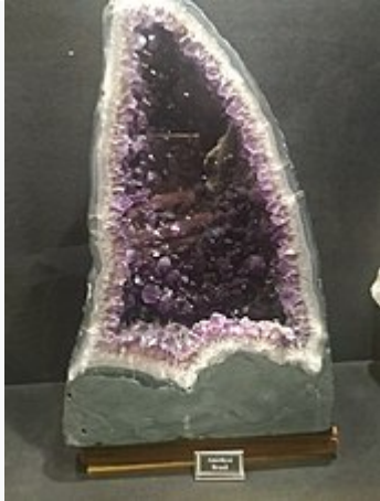
Amethyst from Brazil in the Mineral museum in India

exceeding in quantity Minas Gerais , as well as Mato Grosso , Espírito Santo , Bahia , and Ceará states, all amethyst producers of importance in Brazil.