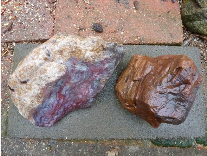
Red flame agate and desert-polished petrified wood