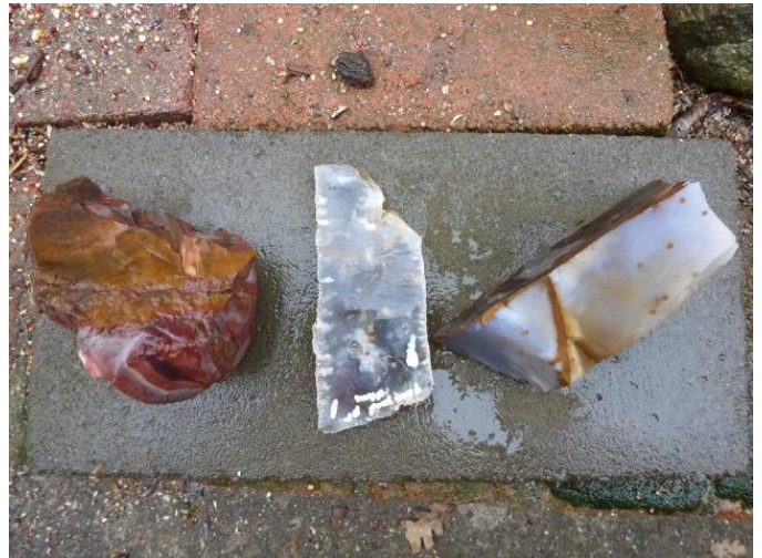
Eye agate, Graveyard Point plume agate and polka dot agate