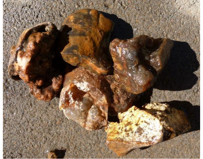
Texas Plume Biscuits