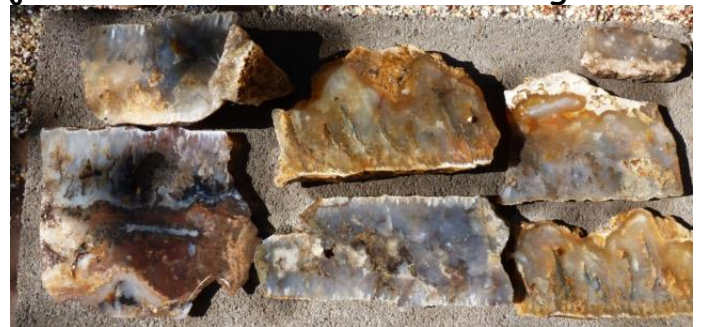
Graveyard Point Plume Agate

You do not need to be a member to participate in the silent auction; you just need to attend the meeting.