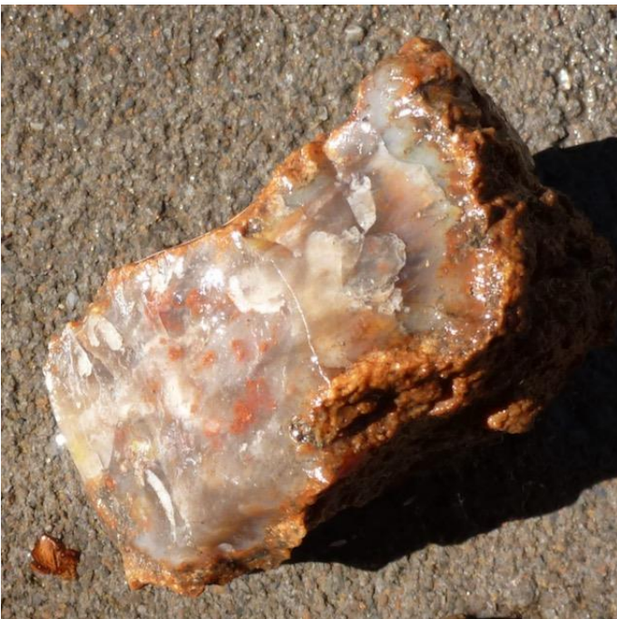
Texas Plume Agate