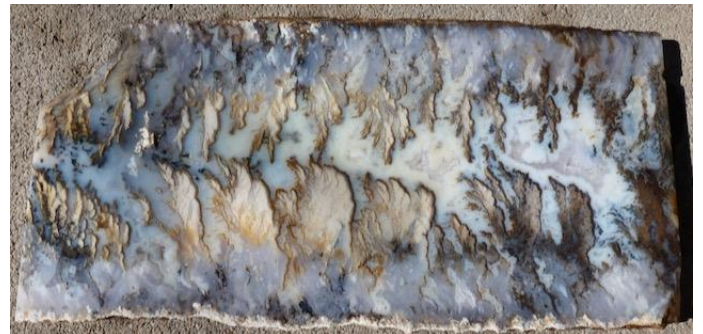
A large slab of Graveyard Point plume agate. This is a seam agate with dendrites of pyrolusite and goethite.

Moss agate does not contain fossil moss and plume agate does not contain feathers. They contain dendrites, tree-like structures made of tiny mineral crystals. Agate is a form of microcrystalline quartz, but the dendrites are inclusions of other minerals. Black dendrites are most commonly pyrolusite (manganese dioxide, formula MnO_2 ). Green 'moss' looks more natural and is usually hornblende, a hydrous silicate of iron, magnesium and aluminum. Red moss agate contains dendrites of hematite (iron oxide, formula Fe_2O_3 ). Goethite (iron hydroxide, formula FeO_2H ) forms dendrites of a golden to brown color.