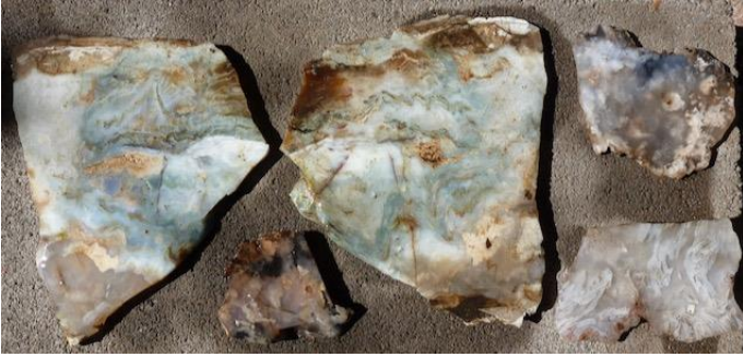
Miscellaneous Plume Agate